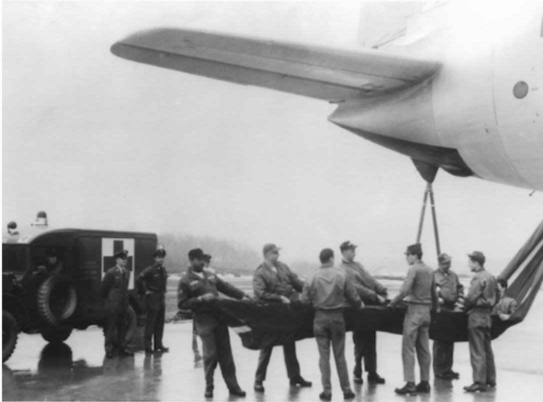
336 MAS loadmasters practicing emergency evacuation chute slide techniques shortly after mobilization, 1968.

Performed aerial refueling worldwide, 1977.