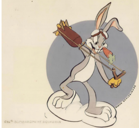
536 Bombardment Squadron (Heavy) emblem: Over and through a grayed light blue disc, BUGS BUNNY proper, standing on a white cloud formation in base, shooting a brown and tan aerial bomb held in the right forepaw with a brown sling shot held in the left forepaw, while chewing a carrot proper. (Approved, 2 Dec 1943)